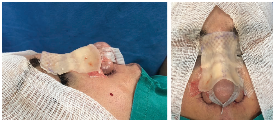
Fig. 3. Thermoplastic splint is applied for a patient.